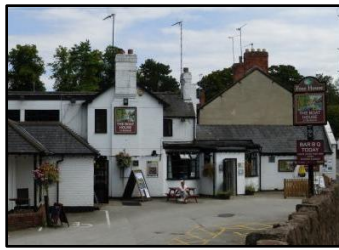
Pub 2: The Boat House