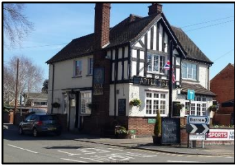
Pub 1: The Apple Tree