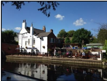
Pub 4: The Navigation Inn