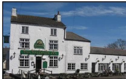
Pub 5: The Waterside Inn