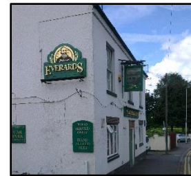
Pub 3: The Soar Bridge Inn